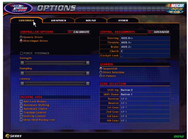
STEP 2: Click the Controls Tab, and make sure DirectInput Driver is selected