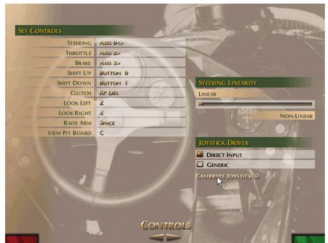
STEP 4: Click on CALIBRATE JOYSTICK(S)