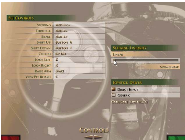
STEP 9: Adjust Linearity (recommended all the way to the left)